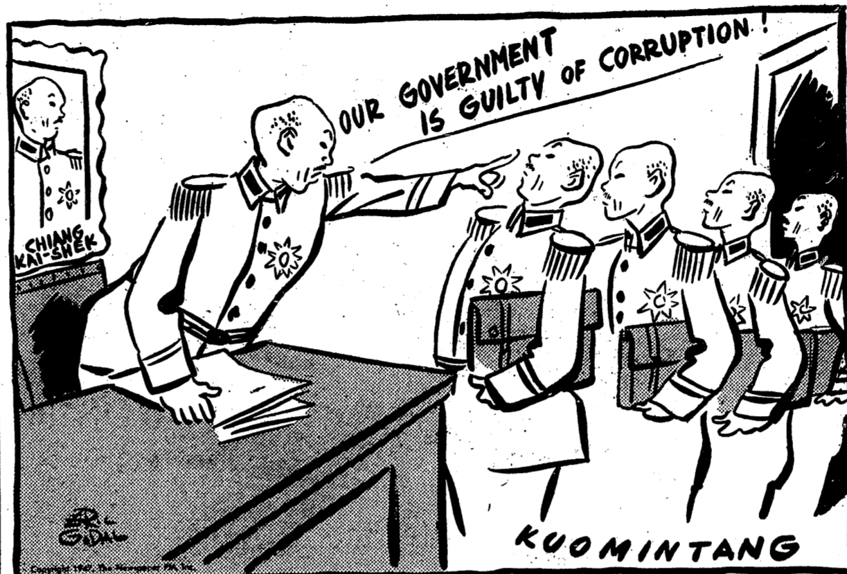
Well, Who's Arguing